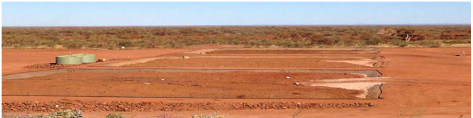
RemActiv being used at a Biofarm